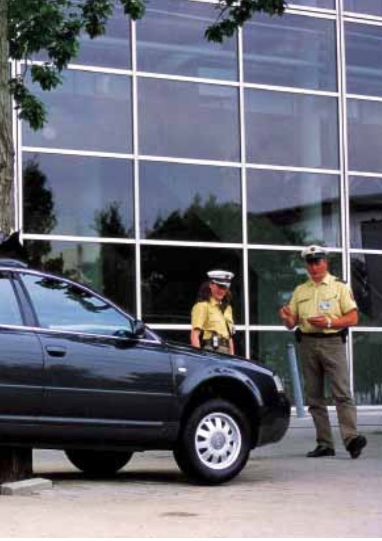
MAURIZIO CATTELAN, UNTITLED, 2000, car installation at the Expo Hannover / OHNE TITEL.

Beuys at a cathartic, more abstract level, while with Cattelan, we identify at a sympathetic level: We feel solidarity with the suffering personality. The viewer identifies with the religious aura of Beuys's vitrines, something spiritually and formally perfect that contains all of the energy dispersed in real time. Beuys used the object to create meaning around his hat, his fishing vest, and his coat. If we look at Cattelan's Picasso head (UN TITLED, 1999), we are admiring the contemporary editing of art history and entertainment, a story and history cut and pasted together, to be manifested in a sculpture. Still looking at the goofy Picasso, we also identify with Cattelan as a street actor, nomadic