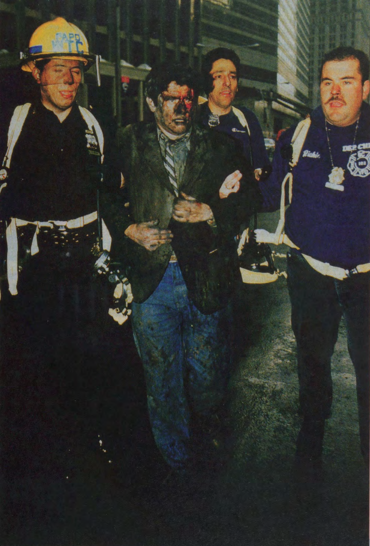
TUNNED Rescuers help a victim after the