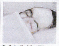
The Death of the Author, 2003