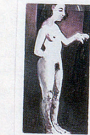
Missing Picasso, 2013