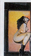
Leather Boots, 2000