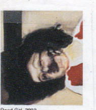
Dead Girl, 2002