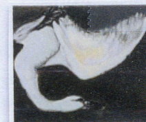
The Swan, 2005

Vanity and Violence The violence are not to be painted. The violence happened before, All paintings become still lifes in the end