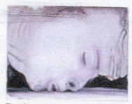
The Kiss, 2003

Vanity and Violence The violence are not to be painted. The violence happened before, All paintings become still lifes in the end