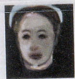
Waterproof Mascara, 2008