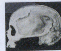
Skull (of a Woman), 2005

the Loss of love versus the magic of the imagination and the 'almost' touch... All paintings become like landscapes in the end, taking the eyes on a trip to the edges.