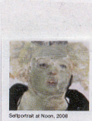
Selfportrait at Noon, 2008

Trying to say hallo again Missing the humour in the dark times. Erotic inspiration. Missing the artwork when it leaves, changes hands. The painting lives its own life, without the painter.