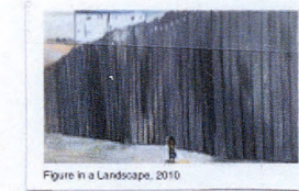
Figure in a Landscape, 2010

Different MODELS All dressed-up Never thought that at the end of the 20th C, everyone would start to 'look as if they've just walked out of the Bible Man MEN and Most Wanted men And a God either forced to Bless America all the time or under another name, kill customists, or in his former name approves of occupied territories and you name them! Oh the sins of the fathers.